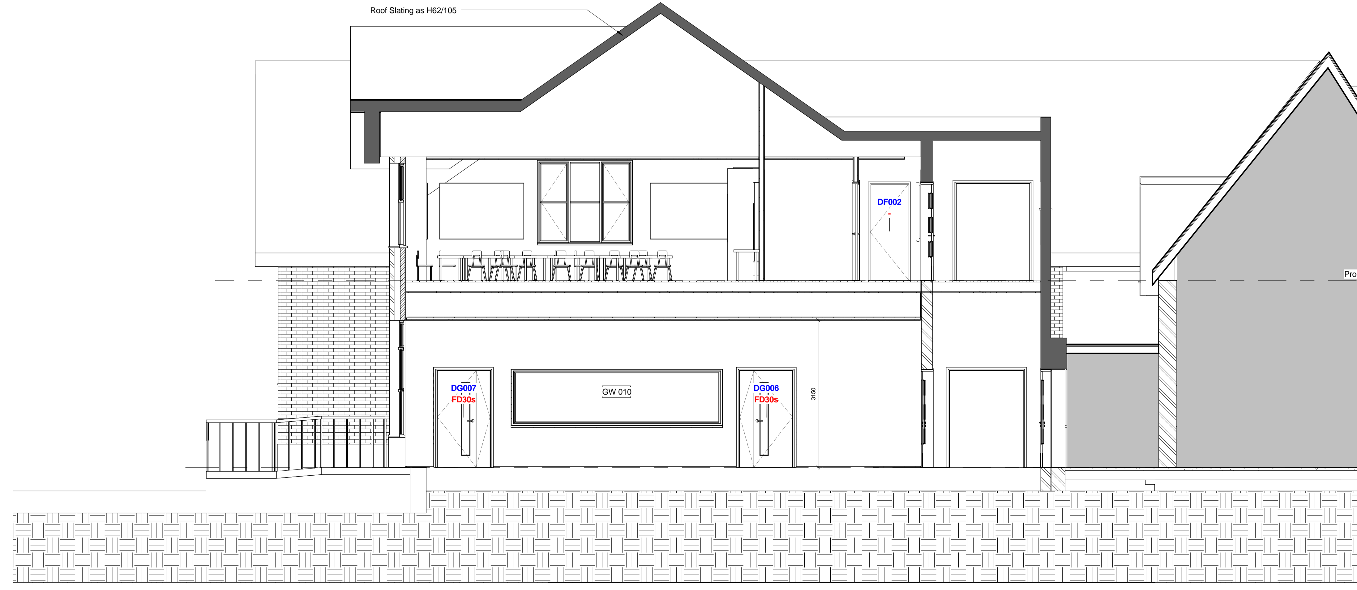
4 Section 5 AB-107 1 : 50